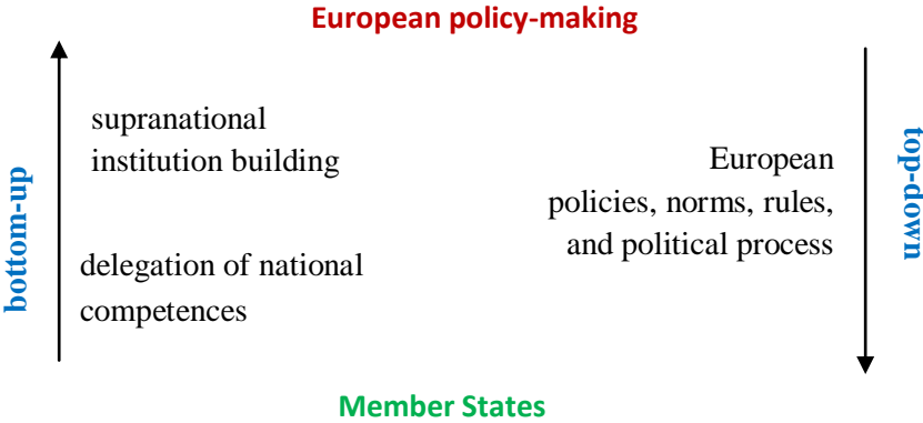
Figure 1: European policy-making: bottom-up and top-down processes

Basically, there are two types of mechanisms, that is, ‘vertical’ and ‘horizontal’ Europeanisation. ‘Vertical policy transfer’ comes through EU policy or European integration processes. Vertical mechanisms seem to demarcate clearly the EU level (where policy is defined) and the domestic level, where policy has to be implemented. By contrast, ‘horizontal’ mechanisms look at Europeanisation as a process where there is no pressure to conform to EU policy models. Instead, ‘horizontal’ mechanisms involve different forms of adjustment to Europe based on the market or on patterns of socialization. EU policy has a precise direction and aims to produce specific compliance at the level of the member states. The soft ‘framing’ mechanisms of ‘horizontal’ Europeanisation are based on the ‘hard’ instruments of EU public policy, such as directives and decisions of the Court of Justice of the European Union.