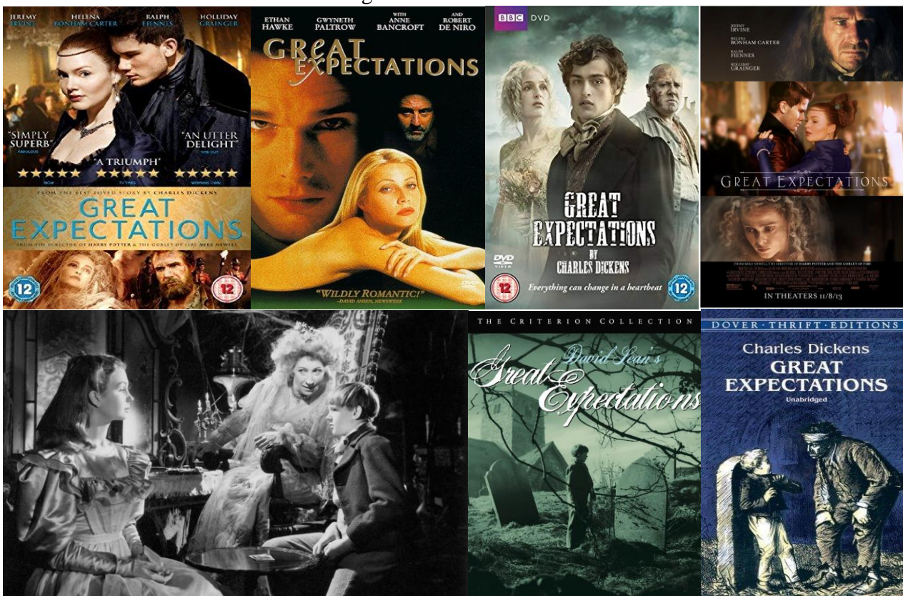
As the numerous film adaptations attest, the novel enjoyed a lively creative aftermath.